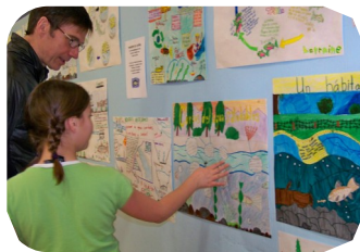
Students describe their research with their families.