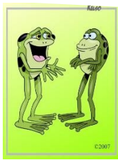
Kelso the Frog is "talking it out."