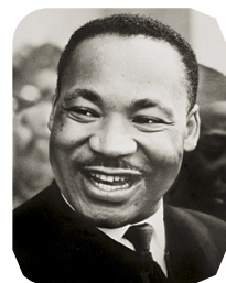
Martin Luther King, Jr.