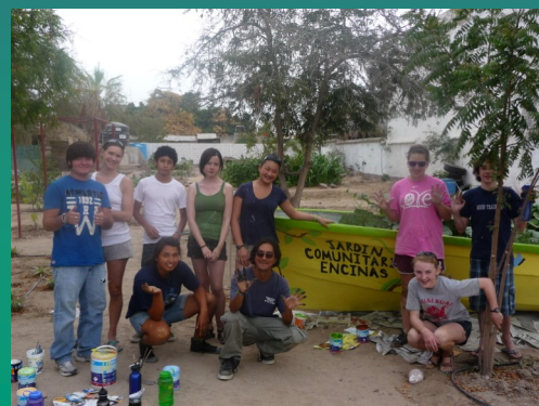
Community Garden Project