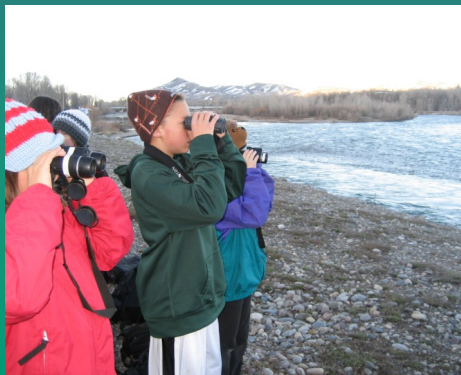
Teton Science School: Wildlife Exploration