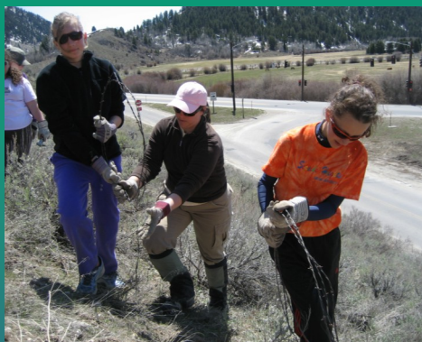
Teton Science School: Stewardship