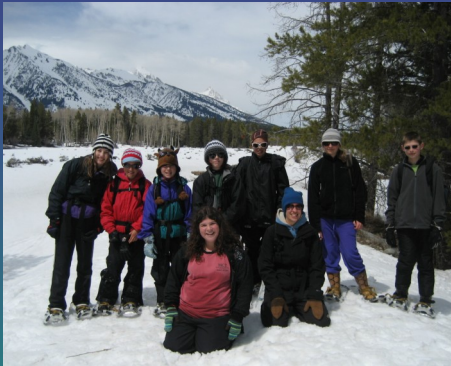
Teton Science School: Community Exploration