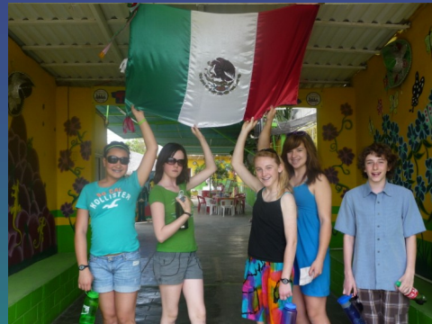
¡Viva la Mexico!