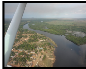
Volando sobre Bella Vista, Beni, Bolivia.